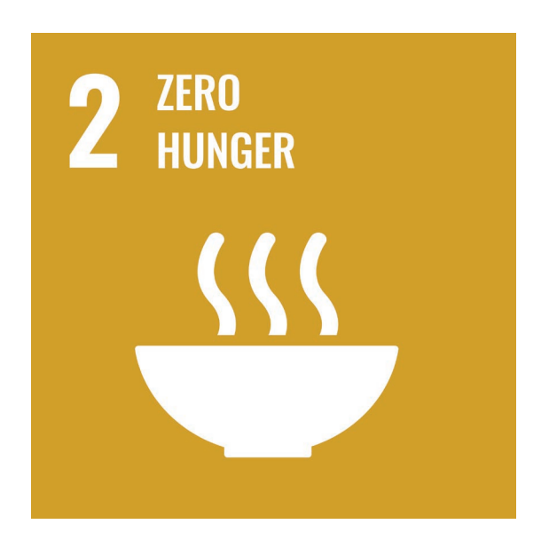
Impact Case Study: Daylight Centre

The forum has worked to provide a safety net for 14 people experiencing homelessness and rough sleeping during the COVID-19 pandemic. The group provided daily welfare check calls and access to food for vulnerable people who were moved into temporary accommodation. This included a support worker and a network of volunteers to make welfare check up calls. Support has also including arranging hot meals and food parcels, advice and welfare visits, liaising with other support agencies, helping complete forms and providing friendship.