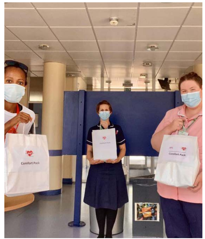
The Lewis Foundation

The grant provided enabled the charity to deliver comfort packs for head and neck cancer patients receiving treatment at Northampton General Hospital. The packs contained items that would help to minimise the severe side