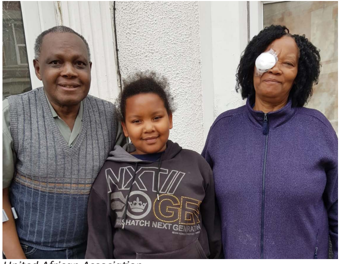
United African Association

United African Association have supported African communities in Corby and Kettering collaborating with five other groups in order to improve the lives of African families and individuals through the provision of products, food parcels and services including training,