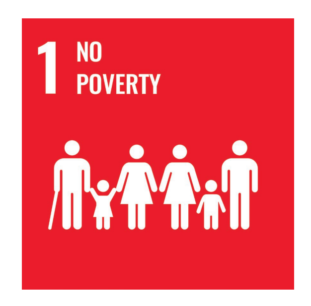
Impact Case Study: Wellingborough Homeless Forum

During the COVID-19 pandemic we have been able to award £895,059 for a range of smaller crisis response grants that have enabled community groups and charities to provide direct services, support and activities to local residents. This has included food aid, prescription and shopping services, wellbeing packs, online activities and courses, counselling and welfare calls, community transport services, care packages, information and advice.