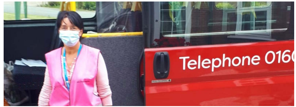
Voluntary Impact Northamptonshire

SOFEA have helped establish a network of Community Larders across South Northamptonshire. 10 Larders have already been established in South Northamptonshire providing weekly food boxes to 1,900 vulnerable individuals and families. The organisation has waived their membership fee during the COVID-19 crisis to allow anyone in need to access and benefit from the larder network. SOFEA have been targeting vulnerable older people as well as families with children who would otherwise get free school meals, disadvantaged individuals and families who are socially isolated, those who are now in financial crisis and those unable to access regular food supplies.