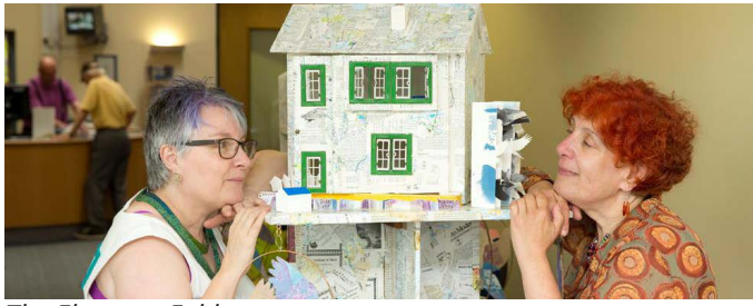
The Eloquent Fold

The Corby based group have continued to provide an online arts group throughout the public health crisis providing creative and remote learning using online digital technology. The group have provided the materials and resources through posted project packs to take part which has been supported through telephone calls, zoom calls, a digital gallery and social media. The activity has provided a lifeline for residents shielding and self-isolating and reduced social isolation and loneliness for 25 residents.